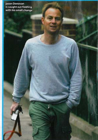
Jason Donovan is caught out fiddling with his small change

Sienna failed to notice his brazen display, but she probably wouldn't have minded. She's no stranger to nudity herself after getting her kit off in movies like Layer Cake and Alfie .